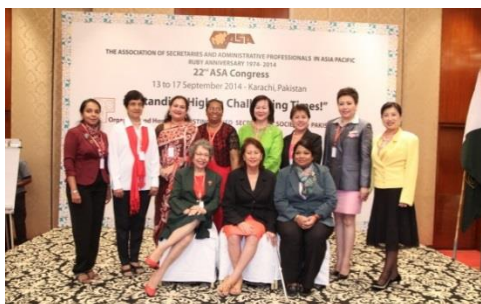
The Council of Presidents