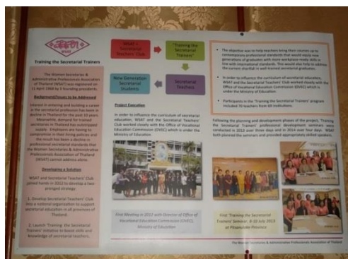
The Winning Presentation - WSAT