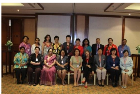
Council of Presidents Meeting

Khorshed Mahal, Avari Towers Hotel was the Congress venue and the delegates stayed at the Avari Towers Hotel.