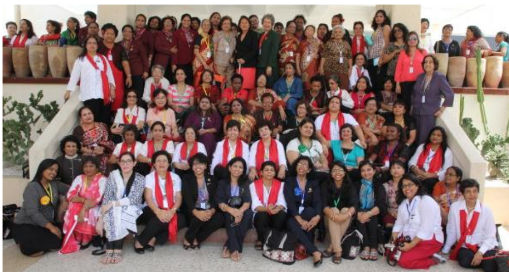
On the steps of the Avari Towers Hotel

At the end of the official photographs, a Zoroastrian member requested for a group photograph of all their community delegates. This was followed by group photos community-wise (i.e. Christians, Muslims, Hindus, Buddhists) for their respective community magazines back home.