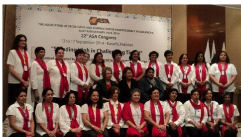
The Indian Delegation