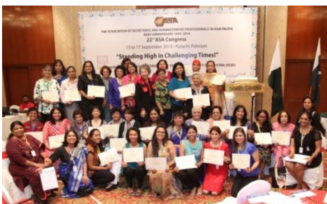
Local Delegates with their Certificates

The 22 nd ASA Congress: What to say... I have never experienced the contentment I have had organising the Congress and bringing it to a successful fruition! This is my fifth congress in terms of attendance and the first I've organized. I have had the pleasure to work with an enthusiastic committee of DSSP members and also a non-member, who have together brought grandeur to Pakistan and to the Distinguished Secretaries' Society of Pakistan.