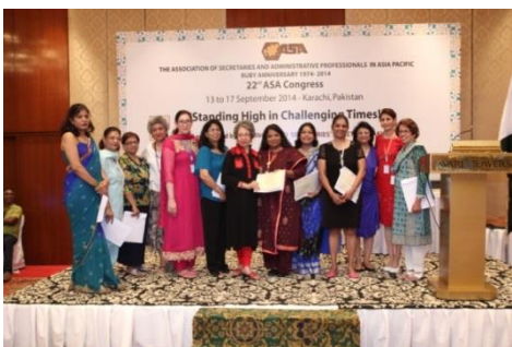
The Organising Committee with their certificates

The opportunity to host an ASA Congress in Karachi for the second time as ASA President has been a great privilege for me.