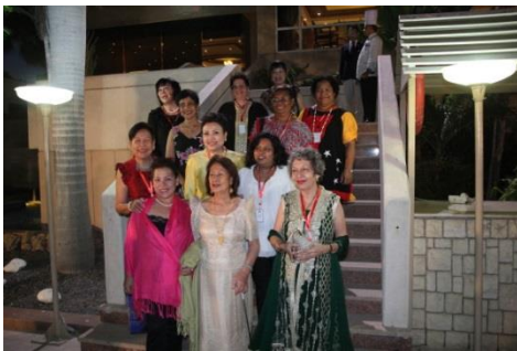
Welcoming the Presidents ...