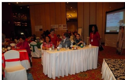
The Judges for the ASA Project