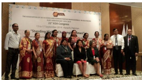
The Bangladeshi Delegation