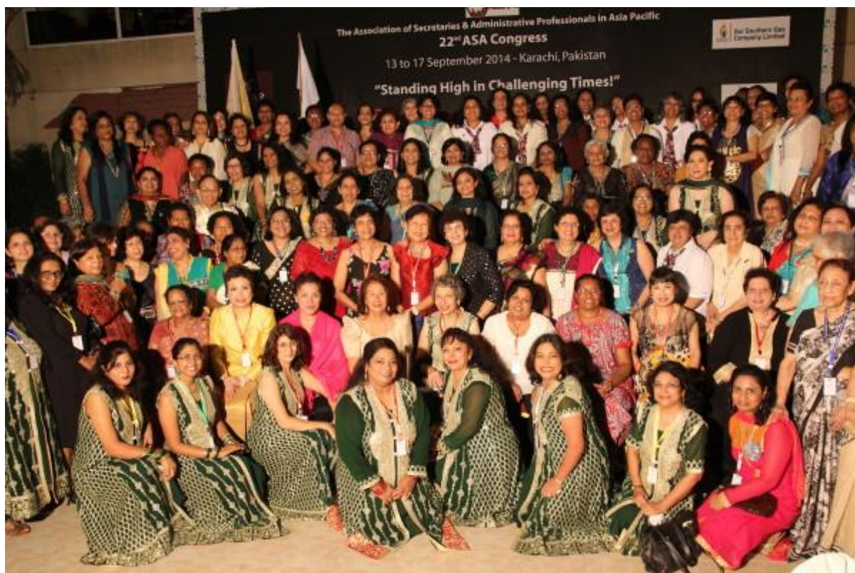
The entire delegation on Opening Night