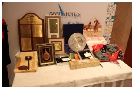
The gifts received