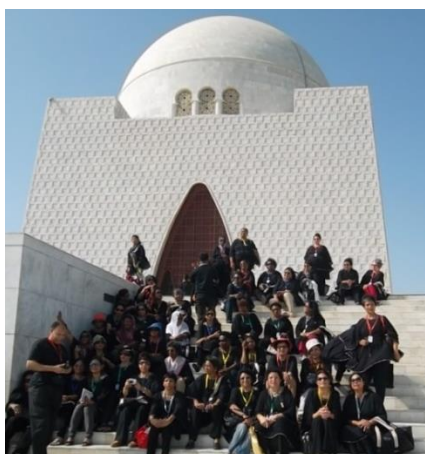
On the steps of Quaid-e-Azam's Mausoleum

After lunch at Asia Live, delegates ventured out on a city tour duly colour-coded into their five groups - Red, Blue, Green, Silver and Gold. The route included Holy Trinity Cathedral, Zainab Market, Bohri Bazaar, the Zoroastrian Fire Temple, Empress Market, Karachi Municipal Corporation Building, I.I. Chundrigar Road (Karachi's business area) and Frere Hall etc. Stops were made at St. Joseph's Convent School, St. Patrick's Cathedral, Quaid-e-Azam's Mausoleum, Masjid-e-Tooba, Shree Ratneshwar Mahadev Temple and Mohatta Palace. Guides at these places of interest provided a brief history. The tour ended with a shopping spree and dinner at the ultra-modern Dolmen Mall at Clifton.