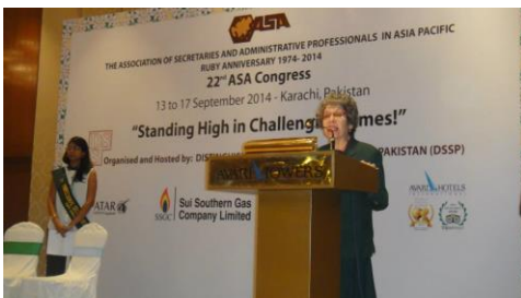
... and the delegates.