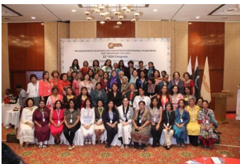
The Pakistani Delegation