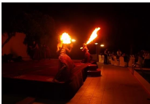
The Fire Dancers

The Opening Night ceremonies began around 8.00 pm with Fire Dancers from Chao's Dance and Theatre Workshop circling the Poolside of the hotel around which the guests were seated. The Fire Dancers pirouetted to the beat of drums ending on the stage towards the rear wall.