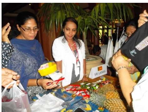
The Sri Lankan Stall at the ASA Bazaar