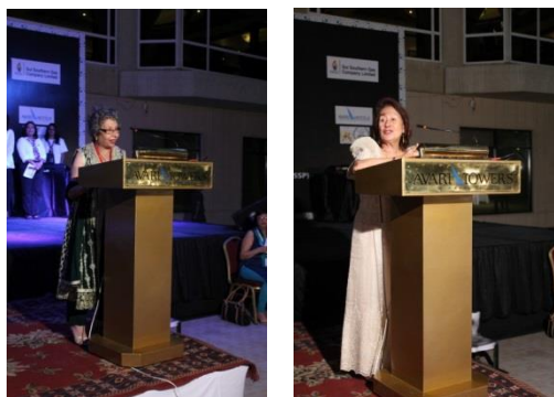
The Welcoming Addresses

Delegates were treated to a scrumptious dinner before a group photography session which concluded the evening's festivities.