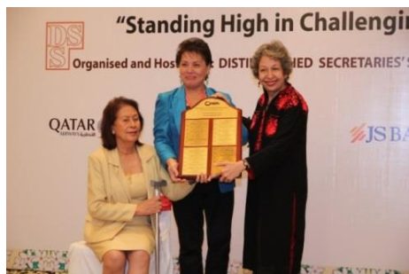
... and Shield to the PAS