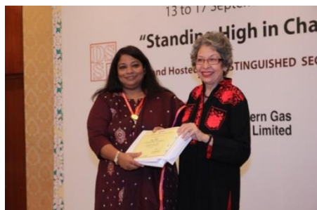
Presentation of Certificates