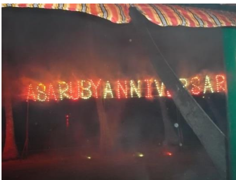
ASA's Ruby Anniversary