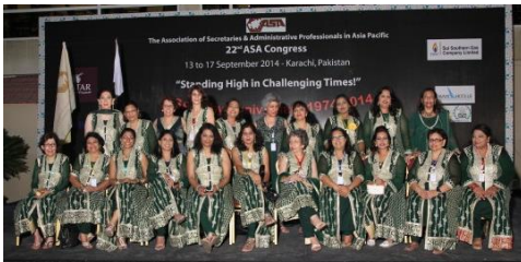
The Organising Committee on Opening Night