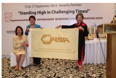
Handing over the ASA Flag...