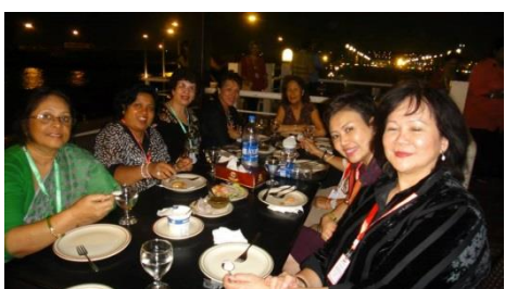
Enjoying dinner at Port Grand