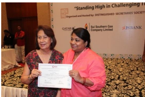
Presenting the 22 nd ASA Congress Attendance Certificate to the Founding President